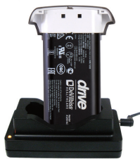
iGo2 Charging Station (Battery not included) 125CH-614