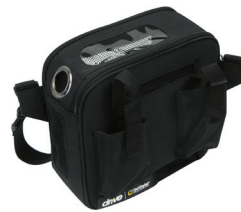
Carrying Case 125D-670