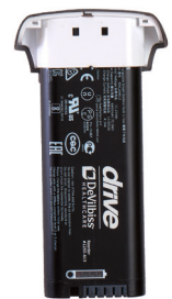
Rechargeable Battery 125D-613